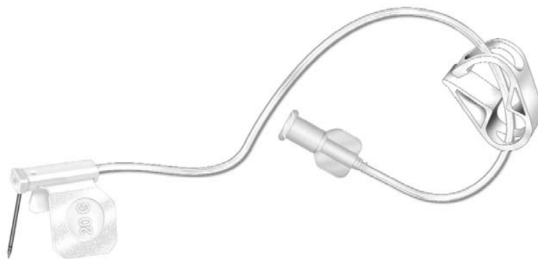
Huber-Needle with clip and extensions