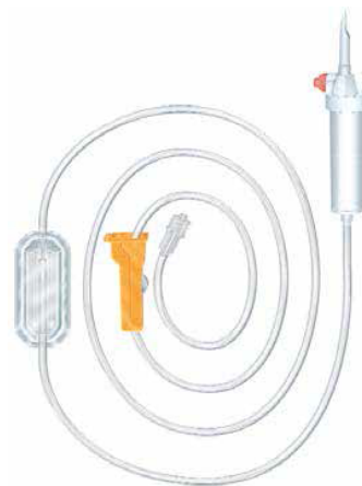
Infusions system for cytostatic

! #&! %&( ) *+02&3#4# { %&*, - +) #&8 / 0/612 34 (5 6'7&8089#&#&:;< (5 =>?;@/## 71 * . #1(5 6'0#7%800DD:2 "$2 %&88% 6 H#8% $7(!>=JK@LJLMNB A