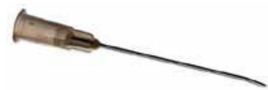
huber needle, 90° curved