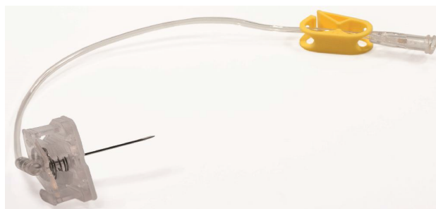
Safety Port-Canula with spring, clamp and tube