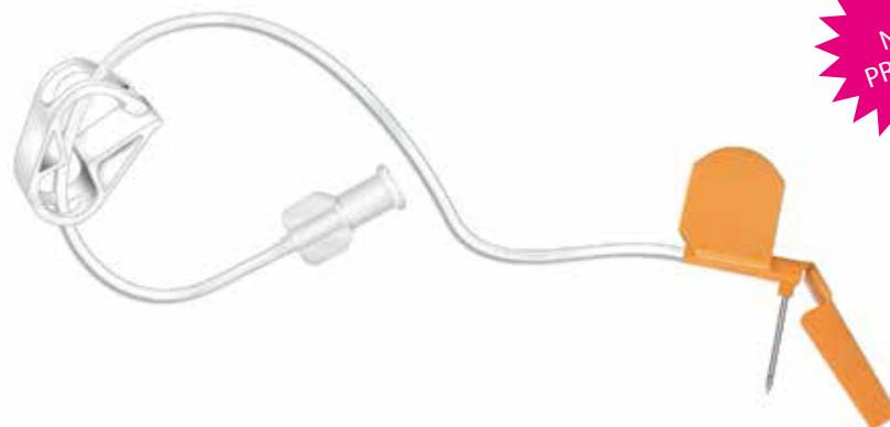
safety port cannula with tubing and clamp