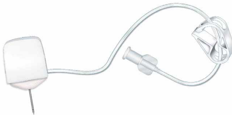
Huber-Needle with Clip & Extension